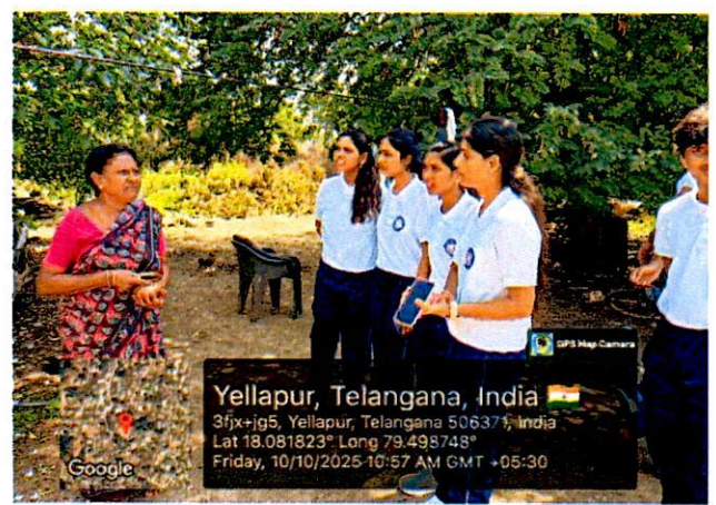
Caption: * "Know Your Rights, Use Government Welfare Schemes" * "Welfare Schemes for All: Information is Empowerment"